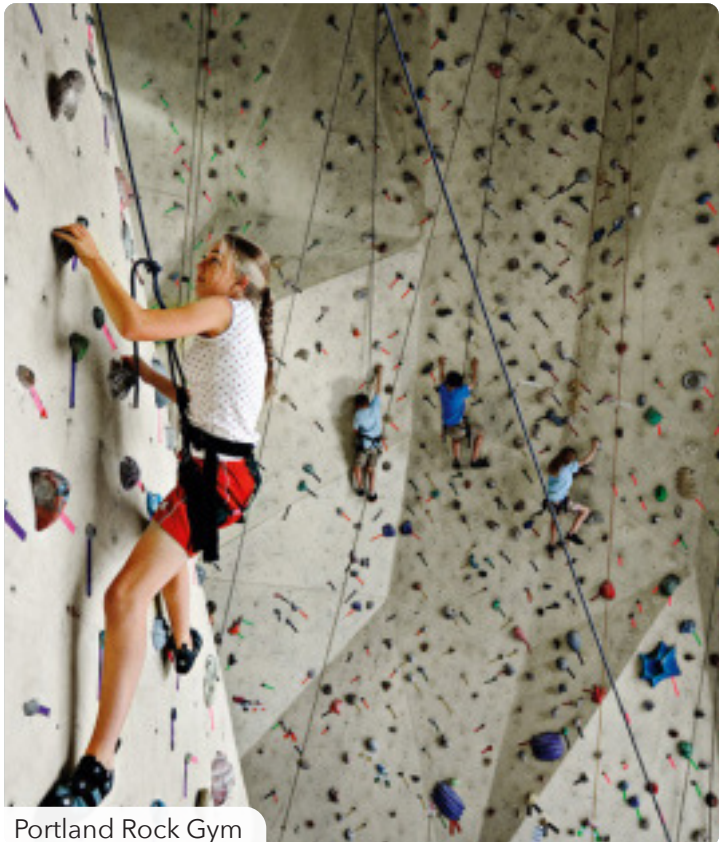
Portland Rock Gym