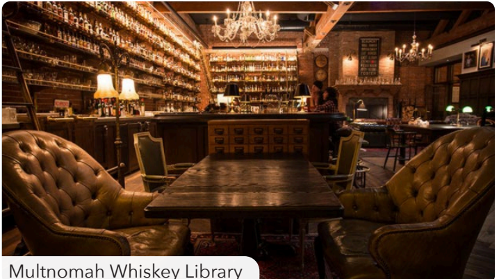
Multnomah Whiskey Library