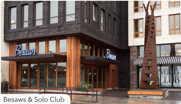
Besaws & Solo Club