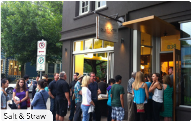
Salt & Straw