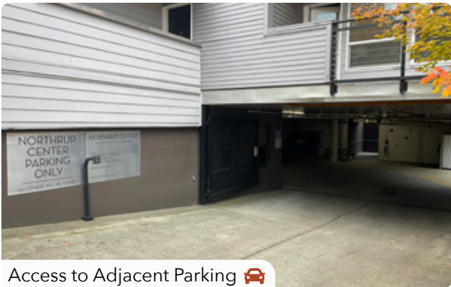
Access to Adjacent Parking