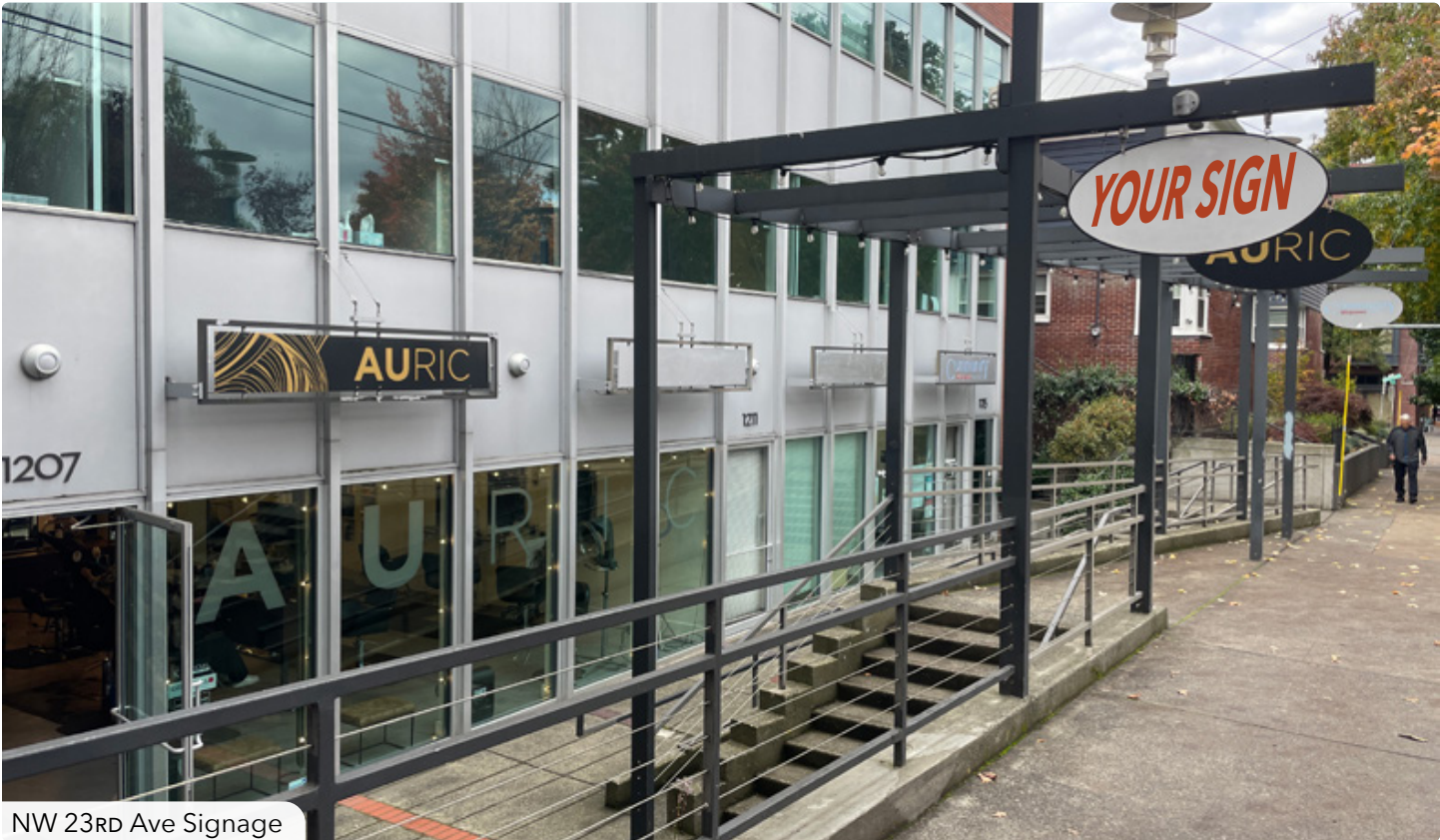
NW 23RD Ave Signage