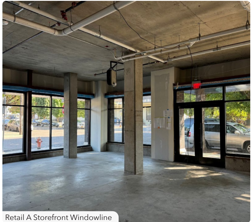
Retail A Storefront Windowline

Soho House Portland | A private members’ club located in the historic Troy Laundry Building in the heart of Portland’s Central Eastside district. This is the Pacific Northwest’s first Soho House and offers amenities like a rooftop pool, gym, restaurant and lounge. Membership provides access to this exclusive social and recreational space.