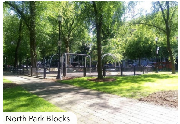
North Park Blocks